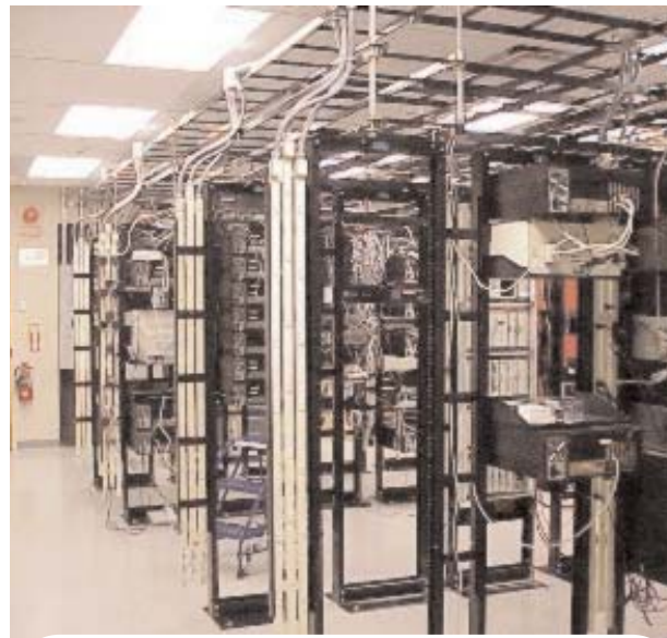
1,000 sq. ft. data center designed, built, and maintained for a multinational web services company.

When you hire WESS, we'll solve the problem you're struggling with. And if we can't deliver the solution you need, we'll help you find the right person for the job. How many other IT companies can say that?